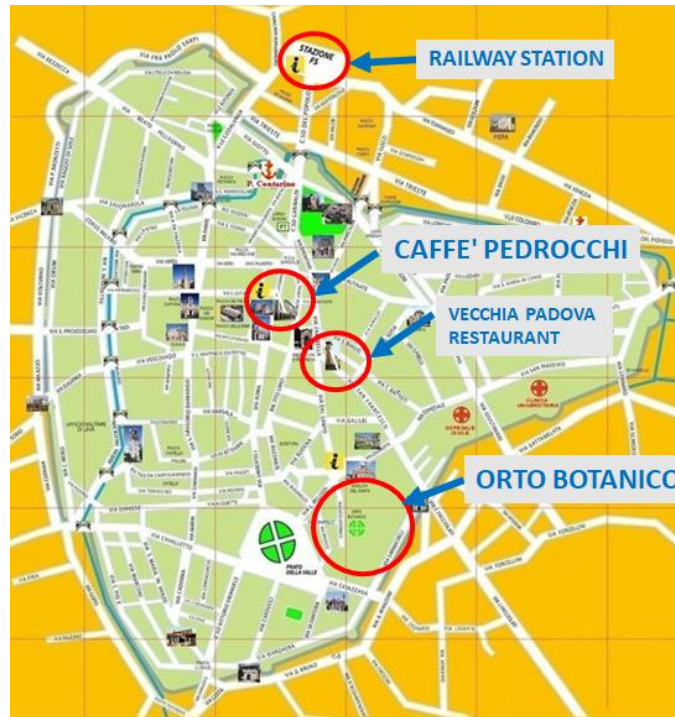
Padova city map

On Wednesday evening a Conference Banquest will take place at the “Ristorante Vecchia Padova” , via Cesare Battisti 37, in the city centre.